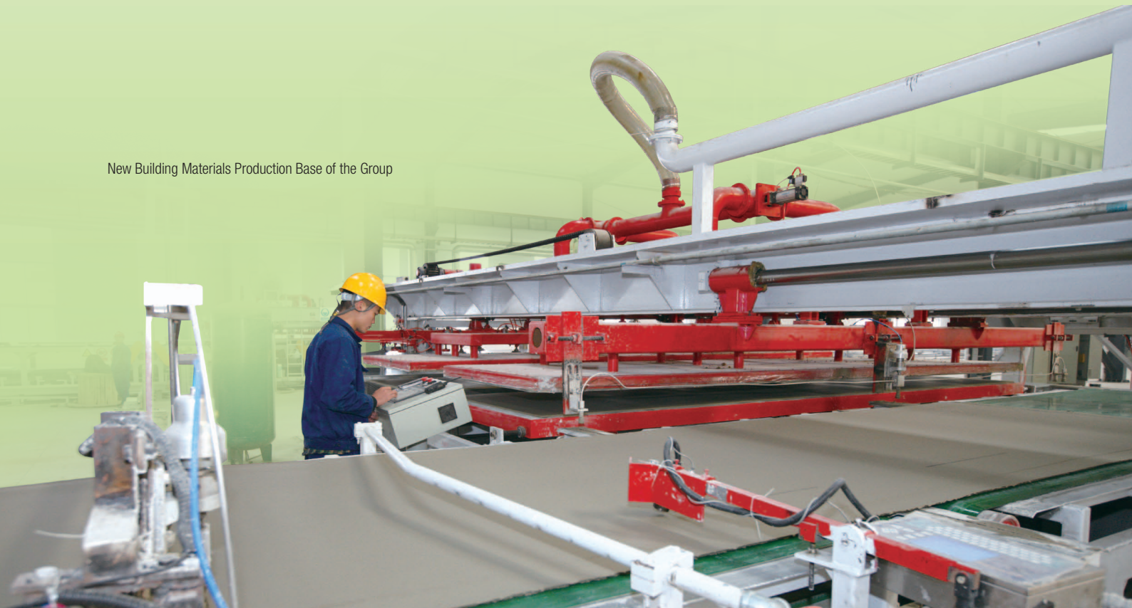
New Building Materials Production Base of the Group

During the Reporting Period, the Group has explored cargo sources for its port logistics business. With rising investment in technological transformation, the Group has recorded a throughput of 10.76 million tonnes and a turnover of RMB72.79 million.