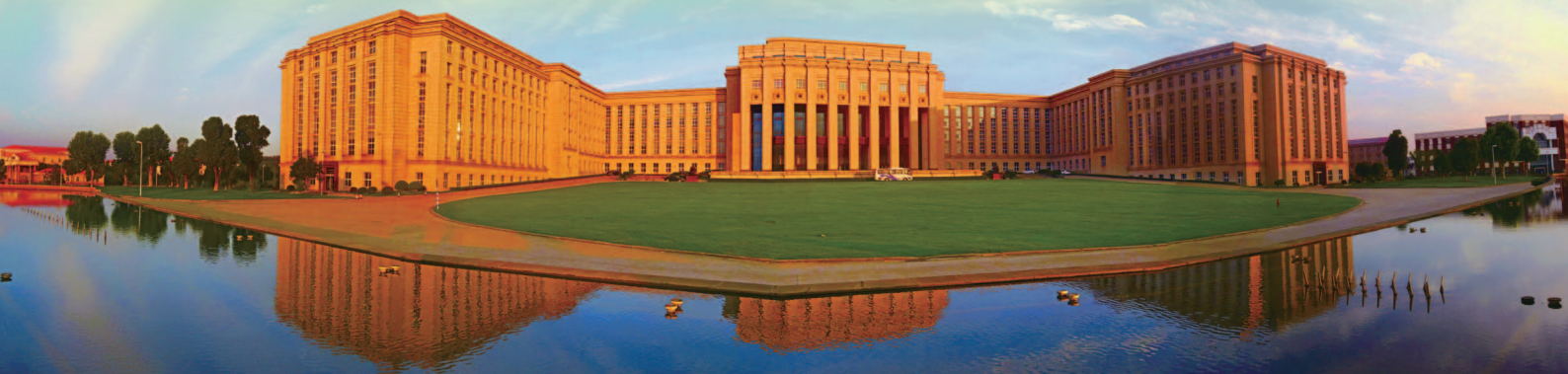
China Headquarter Building of the Company in Wuhu, Anhui

As at 30 June 2015, the Directors were not aware of any other persons other than the Directors and chief executive of the Company who had interests or short positions in the shares or underlying shares of the Company which would fall to be disclosed to the Company under the provisions of Divisions 2 and 3 of Part XV of the SFO as recorded in the register of substantial shareholders required to be kept under section 336 of the SFO.