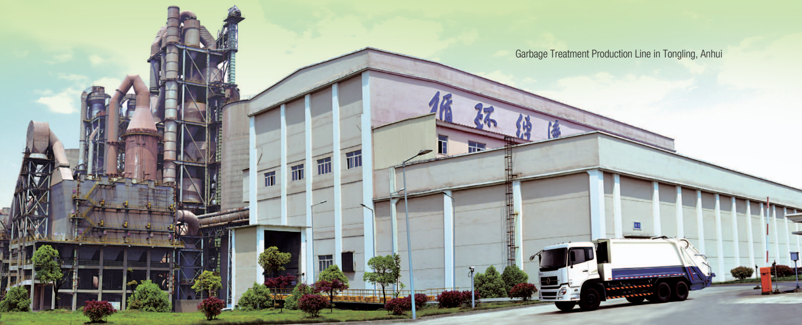
Garbage Treatment Production Line in Tongling, Anhui

The new building materials industry will continue to optimize and adjust the technological process according to the demand of different customer base, and diversify the product categories to continuously increase the added value of products. For the expansion of the sales market, it will adapt to the development trend of “Internet Plus”, increase investments in media advertisement, and attempt network marketing exercise; meanwhile, it will also maximize business order volume and strive to make profit as soon as possible by conducting market survey and reserving potential post-processing enterprise customers.